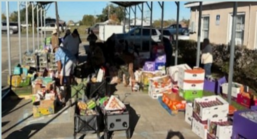
Chauvin community Food Distribution