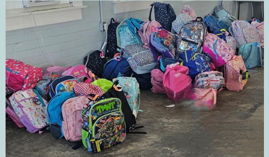
State of Alabama WMU sent the backpacks & did an amazing job! Some of these packs weighed over 10 pounds and the children were so excited!