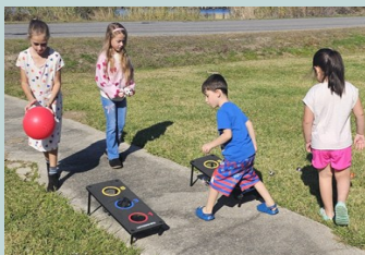
Children playing and enjoying the Nativity Scavenger Hunt and, showing off new backpacks! Children from 2 years to 18 years came.