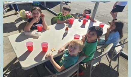
Waiting for bowls of gumbo! SO GOOD!