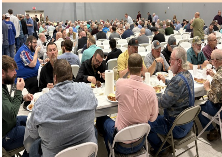
Another photo of our awesome MANUP CONFERENCE!

One of the greatest evangelistic events is VBS! Yes; it's hard work and it takes commitment, but the rewards are eternal. We hope your church has a date set to hold Vacation Bible School this summer. The association is hosting this clinic to provide resources and training specifically for your leadership team. There will be sessions for each age group from Preschool through Grade 6. There will be sessions for missions, music, pastors/directors, as well as arts and crafts. A meal will be served to those attending. Please get together your VBS team for a fun night at the associational clinic. We would ask that you please call the Missions and Ministry Center (255-9030) to register the number attending from your church. Pisgah Baptist Church is located at 113 Pisgah Church Road, Bernice, LA 71222.