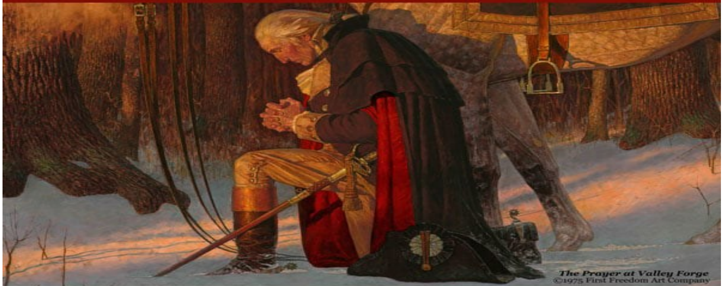
The Prayer at Valley Forge

SEEKING HIM IN ALL GENERATIONS 1 CHRONICLES 16:24 NASB THURSDAY, MAY 7, 2026